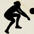
Open Volley Ball Court