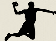
Open Basket Ball