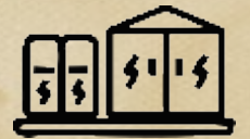
Well Planned Electrification

Some amenities mentioned here are being offered in the Phase - I of Vedanta City and shall remain common for all users including usage by future users for subsequent connecting phases of the project. Community Hall / Multipurpose Hall and other club facilities like swimming pool, table tennis, pool table etc. are provided by the agency, plot owners are entitled to use such facilities on confessional rates on payment of membership fees and monthly charges. Right to admission is at discretion of the provider agency