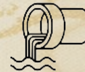
Efficient Drainage System