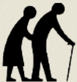
Senior Citizen Sitting Area